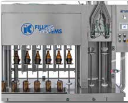
General view of bottling