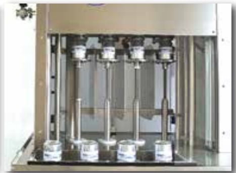
General view of canning